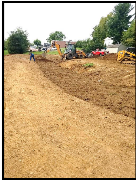
September 21 st