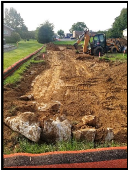
September 14 th