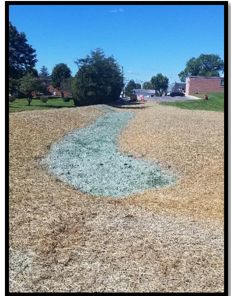
October 1 st