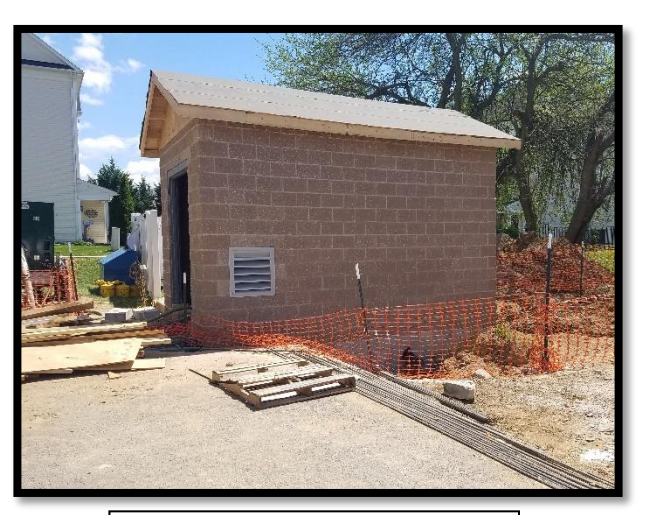
May Construction Progress